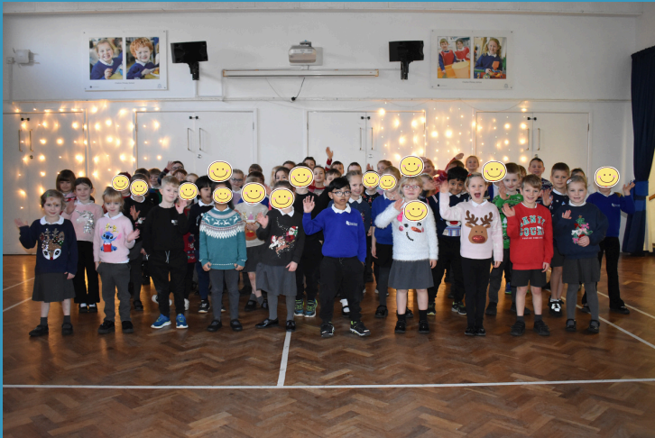
Y2 preparing to sing at Holy Trinity