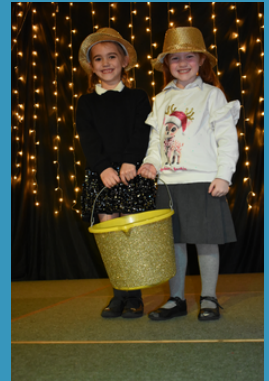
Year 1 Performance